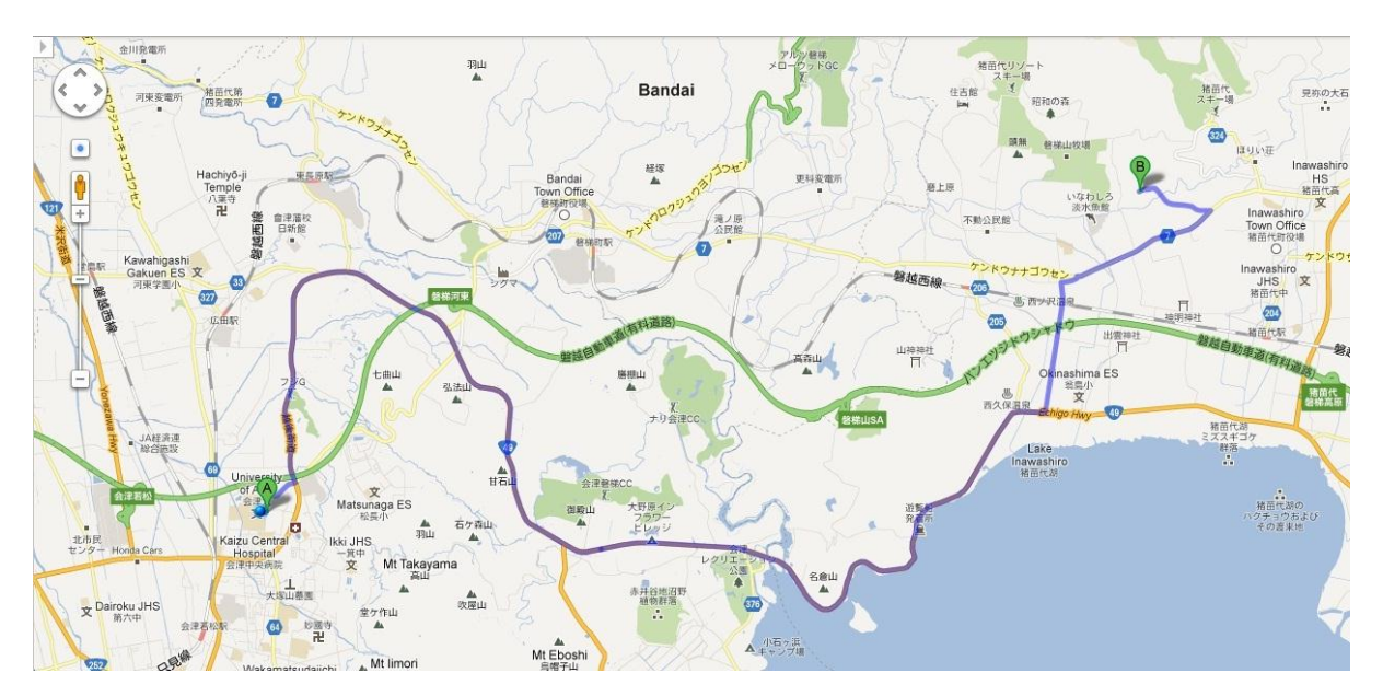
Figure 1 : Route to BYC

More detail at http://bandai.niye.go.jp/ (Japanese only)