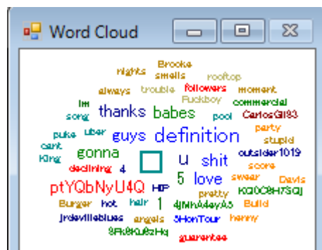
Figure 3. Example word cloud of a realtime stream.